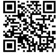
Hyde Park Station web site QR quick link